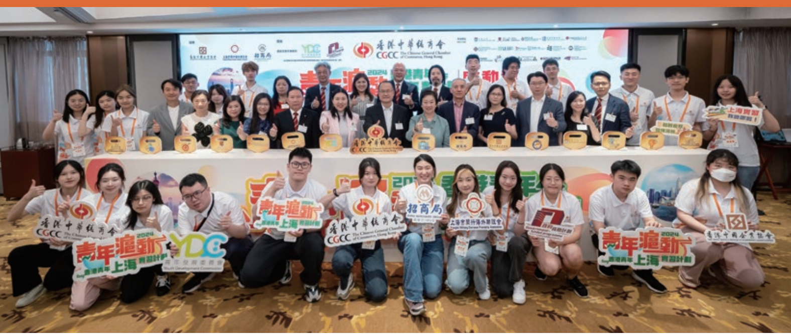
■ "青年滬動" 香港啟動禮大合照 Group photo of the Youth Shanghai Internship Scheme kick-off ceremony