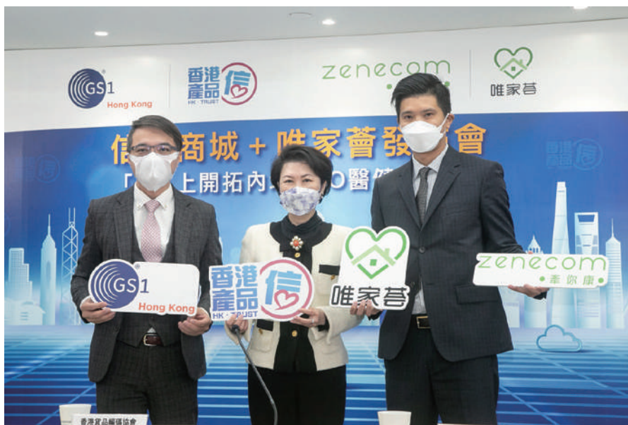
去年與 GS1 HK 合作，消費者通過手機程式掃描標籤，即可驗證產品真偽。WJH joined up with GS1 HK last year, such that consumers could verify the authenticity of a product by scanning a label through a mobile app.