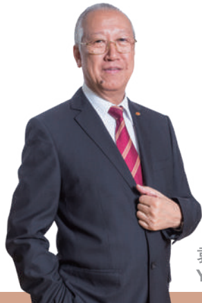
袁武 YUEN MO GBS, JP